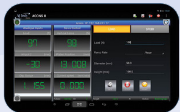
ACONS 2 "7" Touchscreen Colour Display Control Screen

Note: Alternative/custom sample sizes on request.