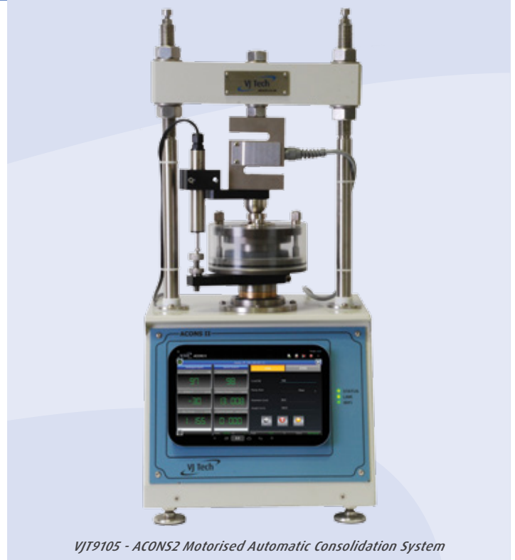
VJT9105 - ACONS2 Motorised Automatic Consolidation System