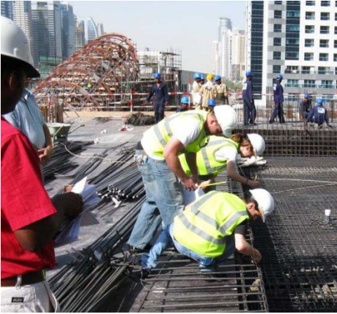
student interns are tying rebars at a construction site.

The internship program was designed with this global context in mind. One of the main elements of the program is to engage American and Middle Eastern engineering students to work together in a summer internship in Dubai, UAE, under the auspices of DCC and the Department of Civil and Environmental Engineering at Syracuse University. The CEO and staff of DCC, working in conjunction with Syracuse University faculty members, designed the curriculum and instructional materials.