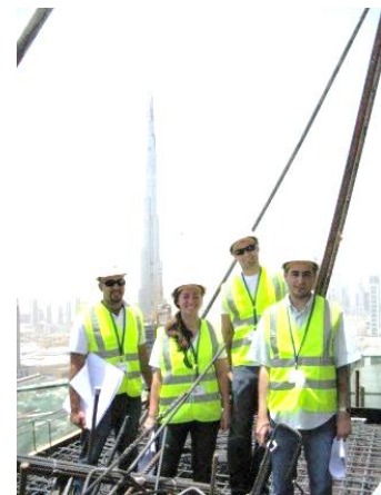
Picture 3: American and Middle Eastern students on an active floor of a building under construction. The building in the background is Burj Khalifa.