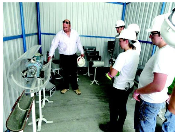
Picture 5: Students at a Raymond International job site in UAE, listening to instructions on cement pipe lining.