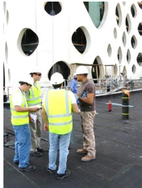
Picture 1: Students listening to instructions from the Project Manager at a job site.

The National Academy of Engineering in its 2004 report "The Engineer of 2020: Visions of Engineering in the New Century" 6 also points to globalization of the marketplace as a dynamic greatly impacting the future of engineering. Competitiveness will depend on the ability of engineers and engineering enterprises to adapt quickly to a multi-cultural and multi-national