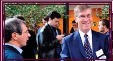
(Right) Dignitaries at opening ceremony