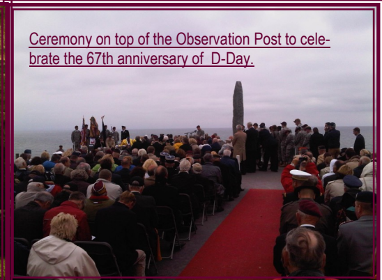
Ceremony on top of the Observation Post to celebrate the 67th anniversary of D-Day.